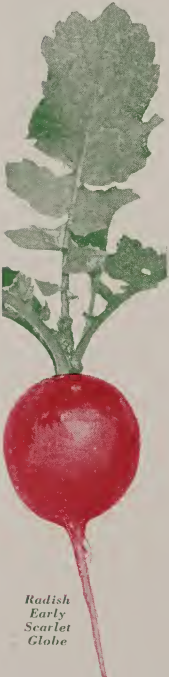
Radish Early Scarlet Globe

COPENHAGEN MARKET. A fine early cabbage that will be found to be a very profitable one. Heads round, medium size, very solid and of fine quality. Pkt., 5c; oz., 45c; \frac{1}{4} lb., $1.50; lb., $5.00.